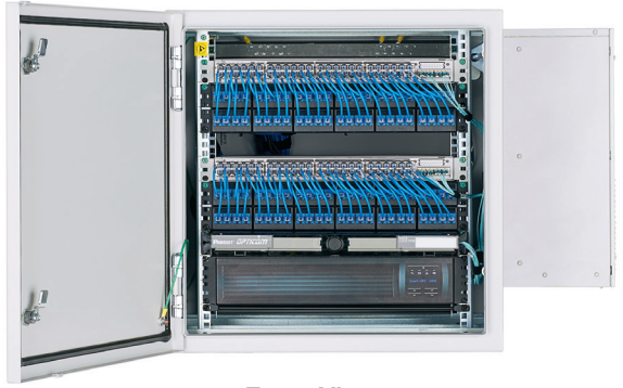
Front View Rear View