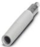
Female test connector, Color: transparent

Female test connector - PSBJ-URTK 6 FARBLOS - 3026450