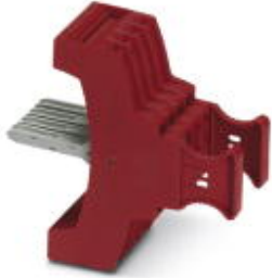
Test plug, Number of positions: 4, Width: 34.2 mm, Color: red

Please be informed that the data shown in this PDF Document is generated from our Online Catalog. Please find the complete data in the user's documentation. Our General Terms of Use for Downloads are valid ( http://phoenixcontact.com/download )