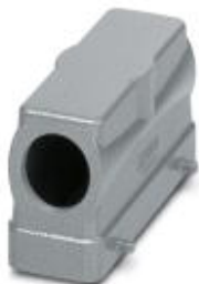
HEAVYCON B24 sleeve housing, for double locking latch, height: 65 mm, with 1 x M32 thread, lateral cable outlet

Please be informed that the data shown in this PDF Document is generated from our Online Catalog. Please find the complete data in the user's documentation. Our General Terms of Use for Downloads are valid ( http://phoenixcontact.com/download )