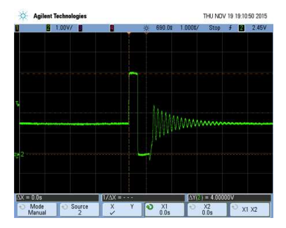
Channel 4 = SWN test point (TP6)

8. continued, verification of DCM and CCM operation of the EVB.